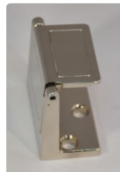
US14 Bright Nickel