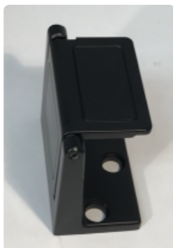
US19* Flat Black