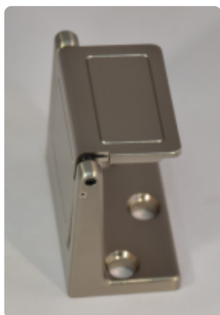
US15 Satin Nickel