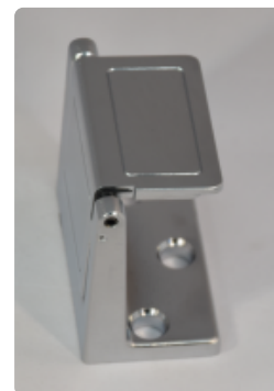
US26D* Satin Chrome