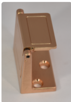
US10 Satin Bronze