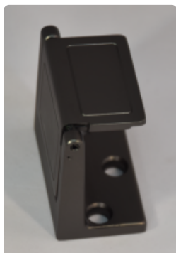
US17A Satin Black Nickel