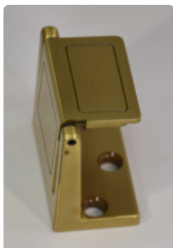
US4 Satin Brass