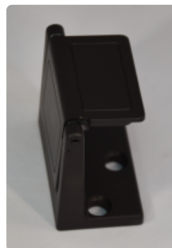
US10B Dark Bronze